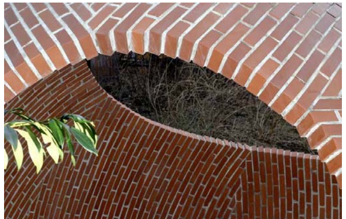
The "Place of Tranquillity" masonry shell in the future court yard of the Dresden Faculty of Architecture

Sponsorship enables organizations like yours to contribute to the success of the 8 th International Masonry Conference while benefiting from a high degree of visibility for your products and services to your target audience. The sponsorship program includes options comprising complete marketing exposure at the conference, such as verbal and signage recognition, logos on delegate satchels and programs and networking opportunities.