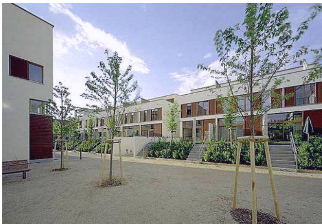
Masonry buildings in the exclusive "Lukas Areal" residential area in the town of Dresden (Architects: Müller-Reimann Berlin/Dresden)