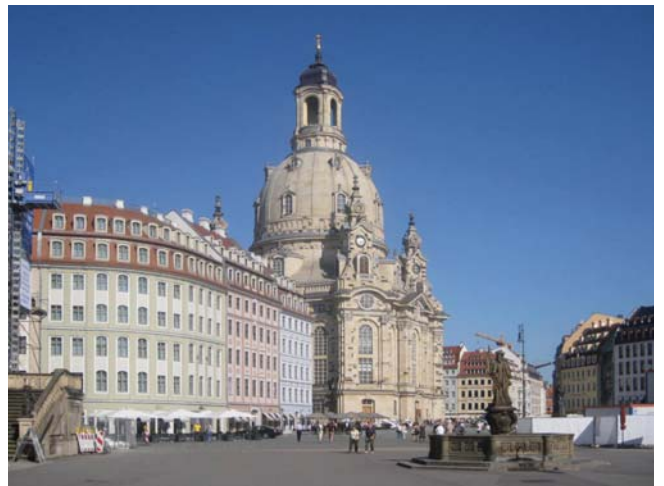
Masonry facades of reconstructed houses at the Dresden "Neumarkt" with the "Frauenkirche"

Additional exposure is offered through an array of printed advertising, including the conference program, conference satchels and the pre-event marketing.