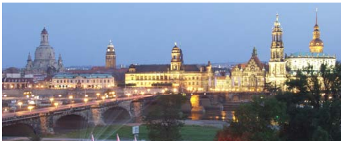
The skyline of Dresden seen from the east bank of the Elbe river by night

The series of International Masonry Conferences commenced in 1986 under the former British Masonry, now The International Masonry Society, open to participants and topics from all over the world. It is one of the four most important international events in the world of masonry research, application and practice. This will be the first time that the conferences will be held outside Great Britain, showing the willingness of the Council and members of the IMS to rotate the venue in accordance with its international character throughout masonry centres in Europe.